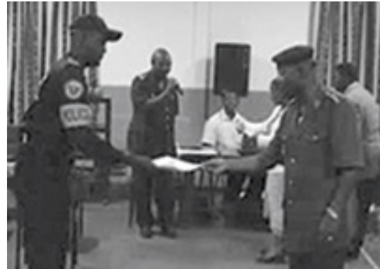
Certificates of participation were handed out to training participants.

Since the passage of a 2005 anti-trafficking in persons (anti-TIP) law, the Cameroonian government has stepped up its efforts to investigate and prosecute criminals involved in human trafficking rings. And yet, many actors in Cameroon charged with overseeing anti-TIP efforts lack sufficient knowledge about the phenomenon or the 2005 law to effectively combat these crimes. The focus of ABA ROLI's efforts in Cameroon is to address this lack of capacity by training an array of anti-TIP actors.