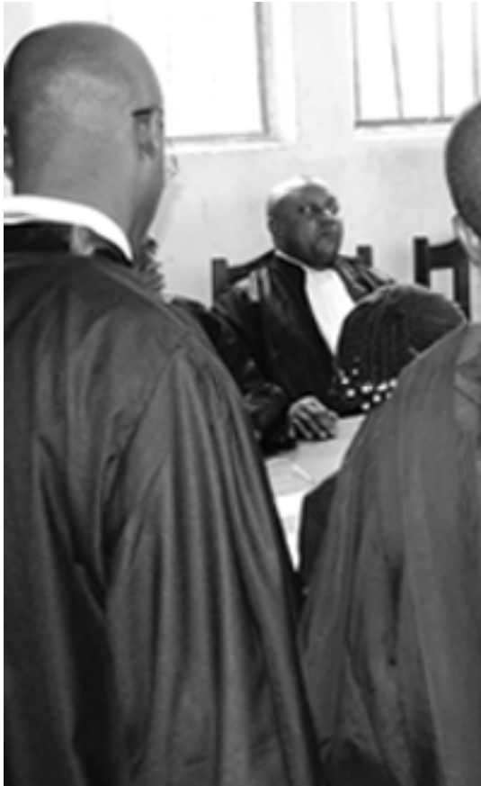
A young victim of rape testifies before the court in DRC.

The Democratic Republic of Congo (DRC) is located in central Africa and is approximately one-quarter the size of the United States. It is a country that, in the last century, has arguably seen more tragedy and devastation than any other in Africa. The Second Congo War,