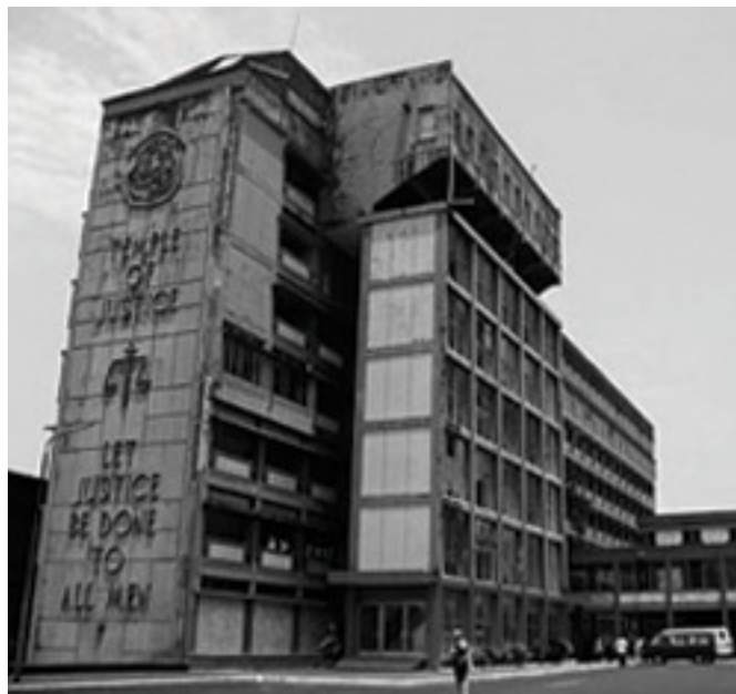
Liberia’s Temple of Justice, prospective home of the Judicial Training Institute.

Of the approximately 300 magistrates in Liberia, only 10 have a law degree — a basic requirement for the position under Liberian law. Many ad hoc appointments to the bench have been made, resulting in a weakened judiciary and an attenuated rule of law in Liberia. To confront this challenge, the chief justice of the Supreme Court of Liberia established a steering committee to explore the idea of creating a judicial training institute (JTI) to fortify the rule of law. Members of the Liberian judiciary and government and of various regional and international organizations — including the American Bar Association’s Rule of Law Initiative (ABA ROLI) — comprised the committee.