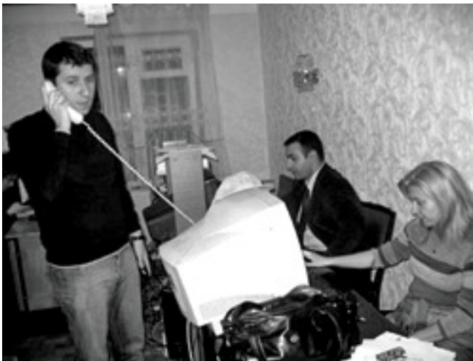
A volunteer lawyer offers legal assistance to a hotline caller on Election Day 2008 in Armenia.

Building public confidence in Armenia's laws and institutions was the goal of an innovative and hands-on effort by ABA ROLI to provide election-related legal assistance in that country. The program, which was supported by funding from Counterpart International, established a toll-free, national legal assistance hotline available to Armenian citizens on election day. The hotline fielded questions and concerns about voting irregularities and associated problems, and it had the capacity to dispatch one of 40 "ambulance crews" to provide legal assistance as necessary. When appropriate, a team consisting of a civic activist, a lawyer, a reporter and an observer was sent to provide on-site support. Prior to the election, ABA ROLI, along with the Council of Europe and a network of non-governmental organizations, held a pre-election conference to foster a hospitable environment for the elections. The event emphasized the role of the legal system in ensuring free and fair elections. Participants included ambassadors, judges, advocates, prosecutors, journalists, leaders of observation missions and international organizations.