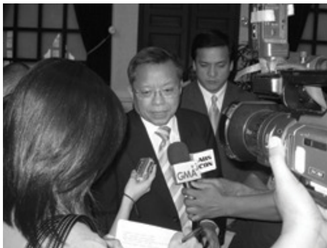
Reporters interviewing Chief Justice Puno.