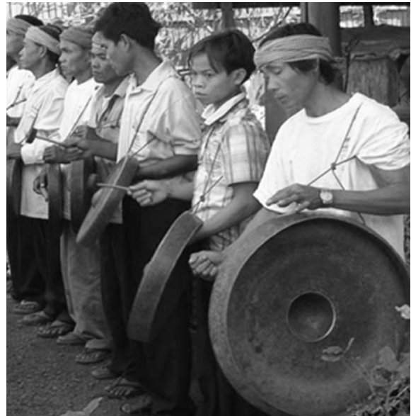
Cambodian villagers take part in a press conference to publicize their legal efforts to reclaim their indigenous lands.

The ongoing Kong Yu case is a glaring example of land grabbing and impunity in Cambodia. Through a series of bribes, lies and intimidation, an indigenous community was divested of its ancestral land by a member of Cambodia's powerful elite—in this case, the sister of the economics and finance minister, who also happens to be the wife of a secretary in the land management ministry. To help resolve the case, the PILAP team performed extensive GPS-enabled land surveys in the area and interviewed many of the families involved. They also conducted advocacy training for the community. As the case is both controversial and politically-sensitive, the path to justice has not been quick or easy. Recently, the judge visited the Kong Yu site with other officials to measure the land. The visit, which was videotaped and covered by local media, created even more tension. The judge appeared to side with the alleged perpetrator and he used threatening and belittling language throughout the visit.