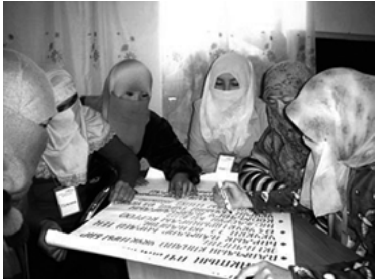
Students in a madrassa in Osh, Kyrgyzstan, learn about citizens' rights through the Street Law program